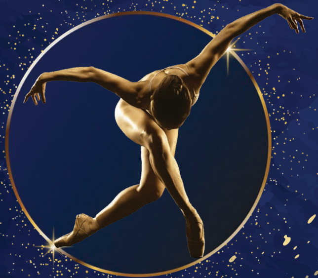
Dancer: Hitomi Nakamura (Japan)